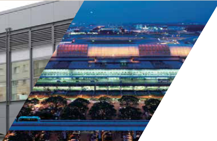
Changi Airport (Terminal 1), Singapore