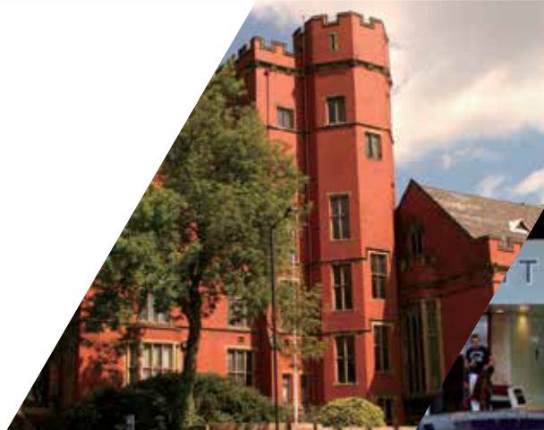
Sheffield University, UK