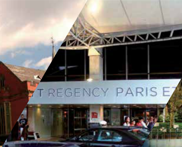
Hyatt Regency Paris, France