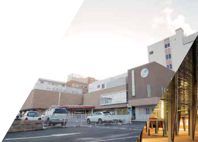
Aizawa Hospital, Japan