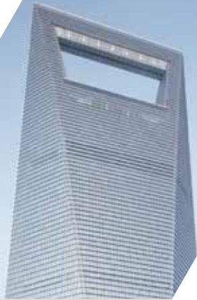
Shanghai World Financial Center, China

Mitsubishi Electric Jet Towels can be found all over the world from large retail businesses to hospitals and even museums.