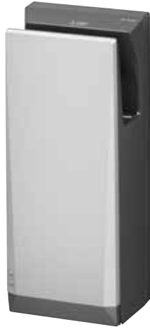
JT-SB216JSH2-S-NE Silver-Dark Grey