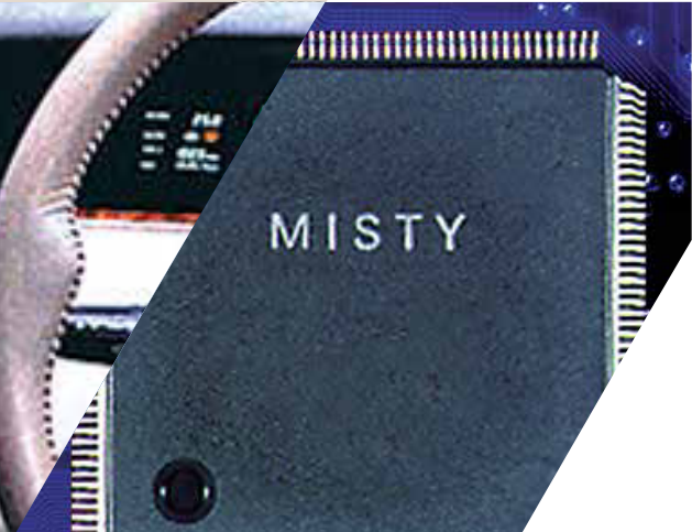
2000 Introduced MISTY® technology as encryption standard for 3rd-generation mobile phones