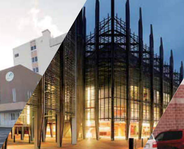
Edith Cowan University, Australia