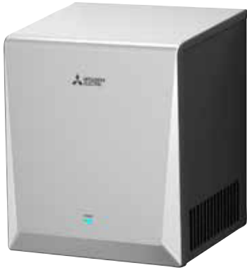
JT-S2AP-S-NE Silver-Dark Grey

The latest evolution of the original dual-jet hand dryers with smart drying achieving amazing drying performance and the lowest power consumption in Jet Towel history.