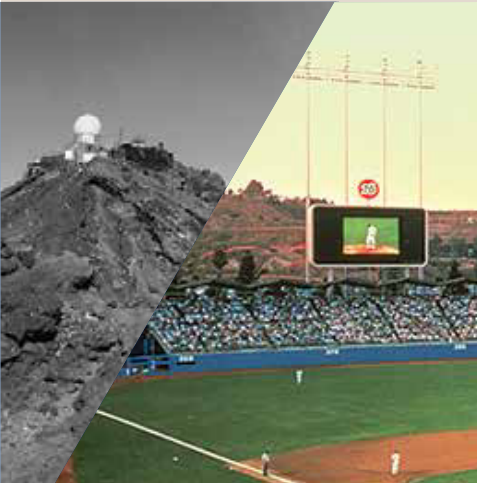
1980 Debut of Diamond Vision Display at Dodger Stadium, USA