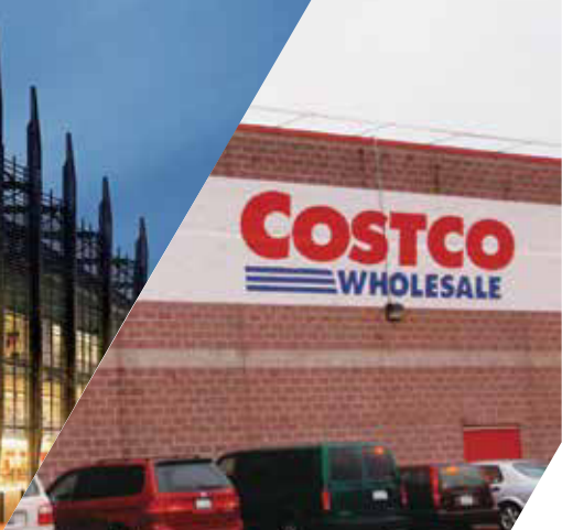
Costco Wholesale Corporation, USA