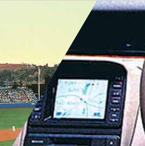
1990 Launched world's first commercial car navigation system incorporating GPS