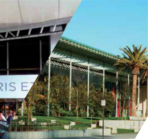
California Academy of Sciences, USA