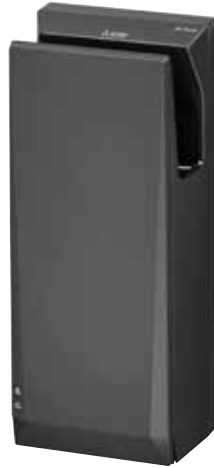
JT-SB216JSH2-H-NE Dark Grey